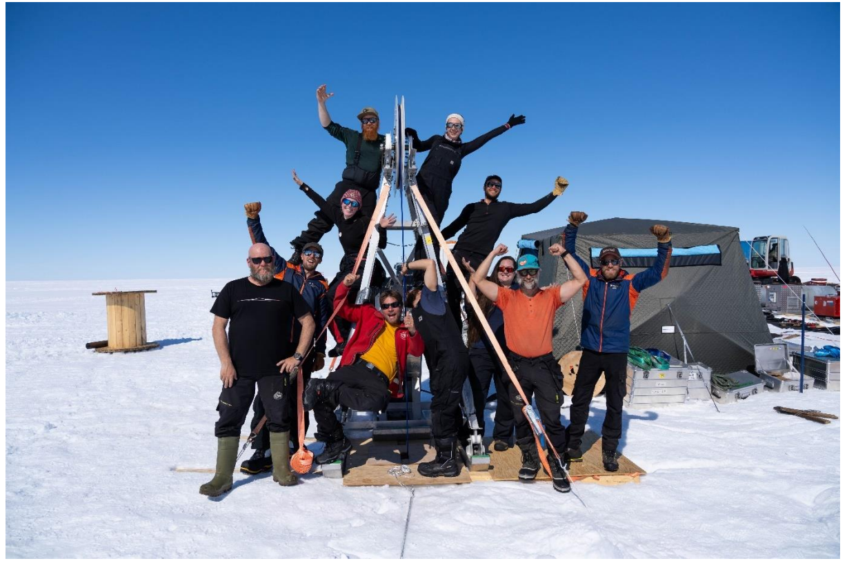
The TONe-Fimbulisen field team after successful deployment of the ice shelf observatory in January 2024.

An open and international collaborative approach was imperative for the successful implementation of the FIO observatory. While the NPI provided the heavy deep field logistic support to realize the 1500 km overland traverse to the drill sites, including field safety and domestics, British Antarctic Survey contributed with the hot-water drill and expertise that roots in decade-long fruitful science collaborations. In addition, collaboration partners from US (Cornell University) complemented borehole instrumentation with under-ice robotics (Icefin) to gather detailed observations of the under-ice shelf geometry and hydrography in the ice-ocean boundary region. In combination, the collectively obtained datasets will contribute significantly to developing new formulations of basal melting for global-scale climate models that will ultimately reduce uncertainty in future sea level rise, in addition to the continuation of a unique time series of the ocean climate at the East Antarctic coastal environment.