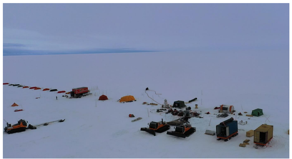
A bird's eye view on the hot-water-drilling field camp on Fimbulisen.

Time series from the old moorings have been analysed as part of the iMelt project (Lauber et al. 2023a, Lauber et al. 2023b, Lauber et al. 2024, Lindbäck et al. 2023) and datasets published (see reference list).