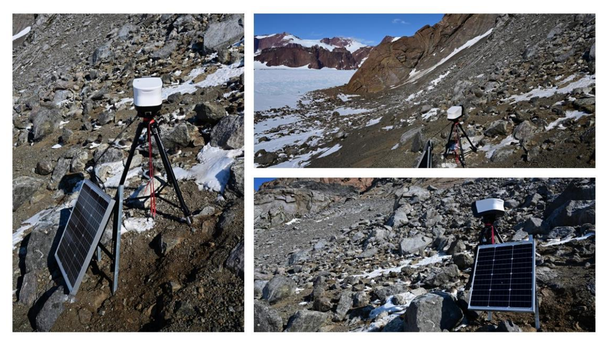
The camera systems in Jutulsessen after the upgrade in summer 2023/24.

Also, the winter storm that moved some of the cameras, also damaged the weather station installed at Svarthamaren. Some sensors needed replacements and the station was moved to another, more sheltered location, closer to the bird colony. All sensors are now working properly and transmitting weather data daily.