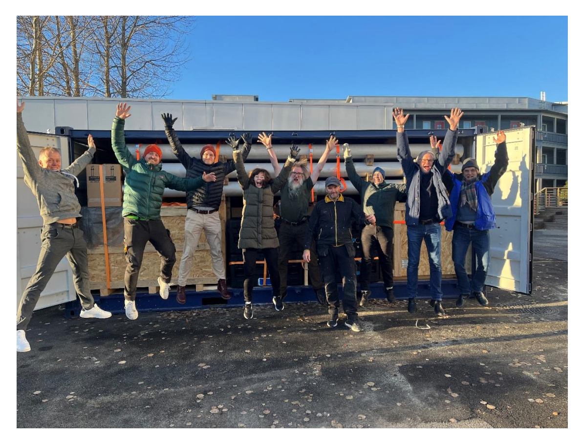
The NORSAR team at Kjeller is delighted after successfully packing the container with equipment and instruments for the seismic- and infrasound array, which is now headed south with the Silver Arctic.

station will be run also on renewable energy, and that a windmill park and a field of solar panels will be established near the station. It is known that in particular windmills produce seismic noise, which reduces the capabilities of seismic stations and arrays even at larger distances. In the case of Troll, simulations were made that made it evident that a negative impact on the seismic array in the planned location can be expected. NORSAR had the opportunity to take part in the NPI organized study tour to Troll Research Station in January 2024, and was able to investigate alternative array locations at larger distance from the planned windmill installations. The conclusion of this tour was that there exist other alternative locations for the array. The discussion on location is still on-going.