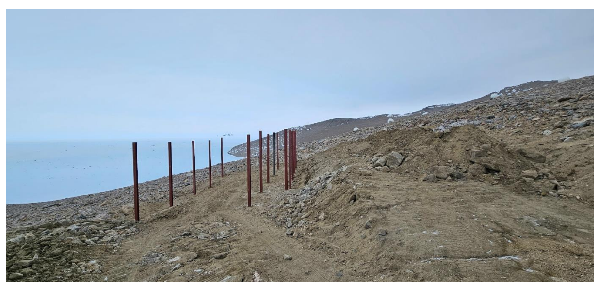
Ongoing groundwork for ICO showing the poles for the ICO containers.

system from MeteoModem and Sagim in France. The radar is a FMCW-35 Ka-band scanning cloud radar manufactured by Radiometer Physics GmbH (RPG) in Germany. A HATPRO-LT microwave radiometer is also being purchased from RPG, and a CL61 depolarisation lidar is being purchased from Vaisala.