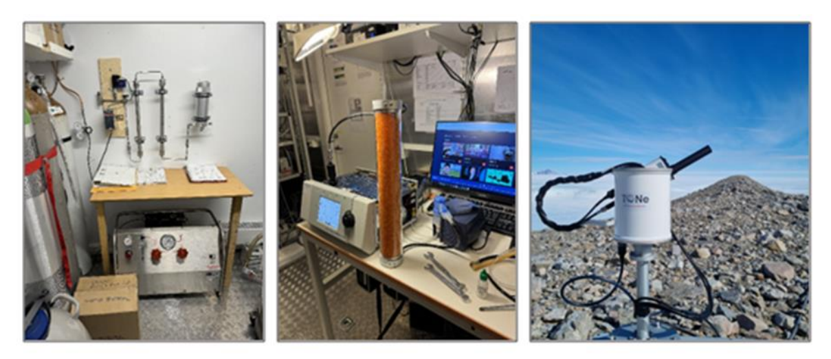
Left: High pressure compression system for flask filling, middle: Calibration set-up for the APS and right: The Pandora instrument installed at the ACO.