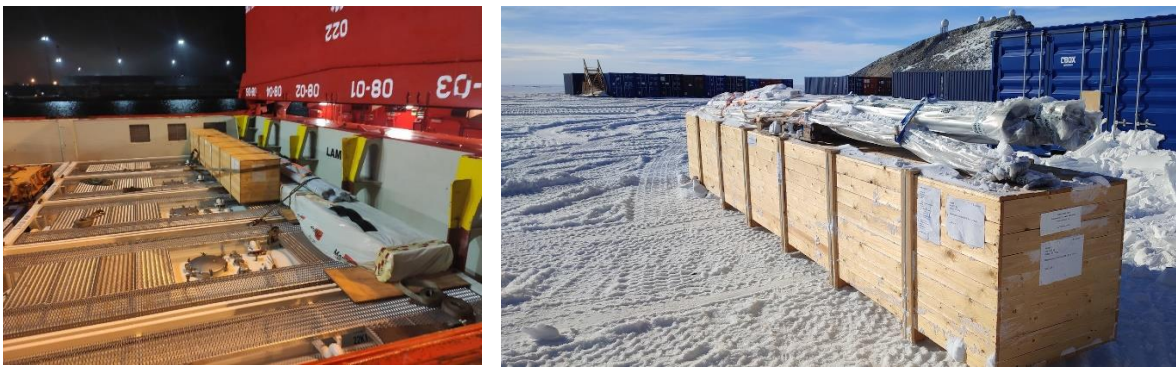
The 18-meter mast for the Ionospheric Observatory's digisonde, aboard the Silver Arctic (left), departed for the south and safely arrived in Antarctica, positioned on the ice outside Troll Research Station (right).